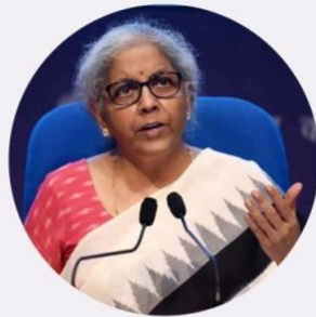
Nirmala Sitharaman Finance Minister